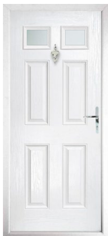
Regency Glazed FD 30S