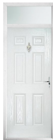
Top light configuration