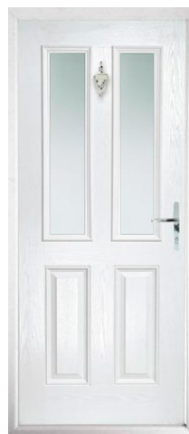
Jacobean FD 30S