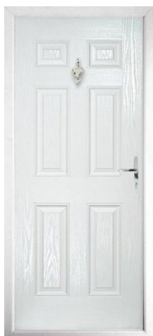
Regency Solid FD 30S